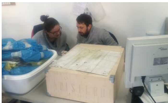
Figure 3 – Technicians of Agripiemonte Miele using the BeeVS

The technicians of Agripiemonte Miele have made the first 300 scans in a single day.