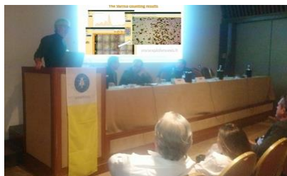
Figure 1 - Presentation of the BeeVS at ApimondiaRoma 2019